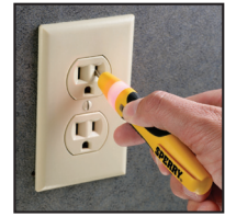
Test AC Voltage